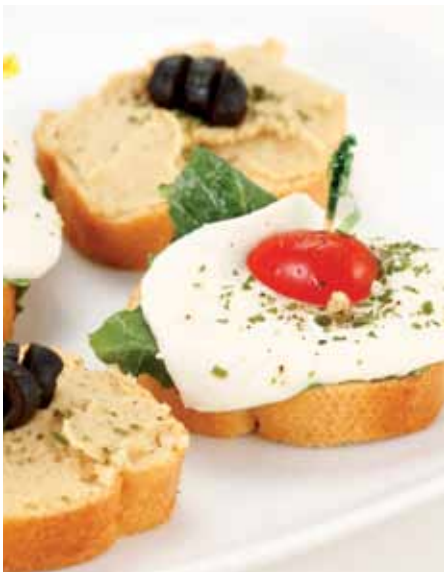
Vegetarian Sandwiches $250

To accompany the finest foods, choose the finest wines. Take advantage of our special wine discount 6% extra off 6 bottles and 12% extra off 12 bottles. Cheers!