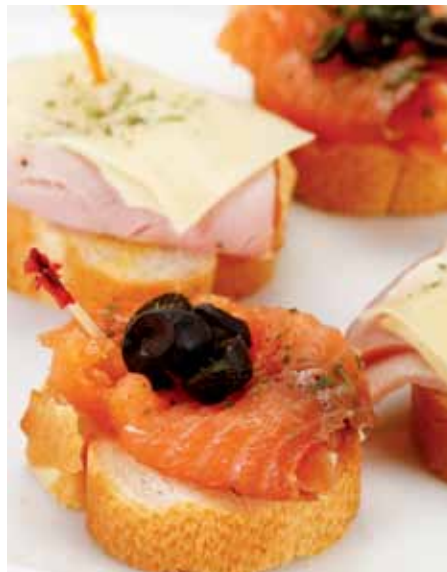
Meat Sandwiches $250

Carrots & Cucumber Grated Carrots with Olive Oil & Herbs, Cucumber